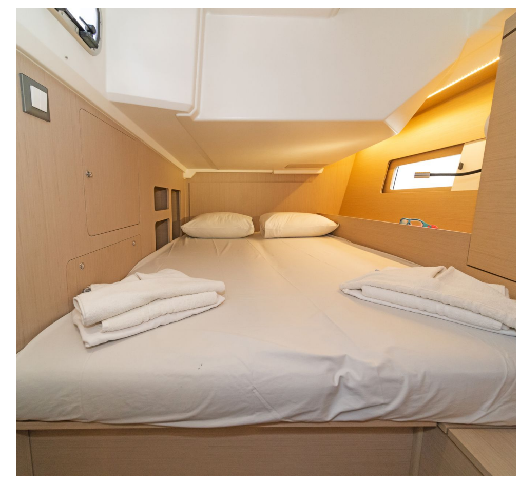
Oceanis 46.1 Beautiful Helen, Model 2020