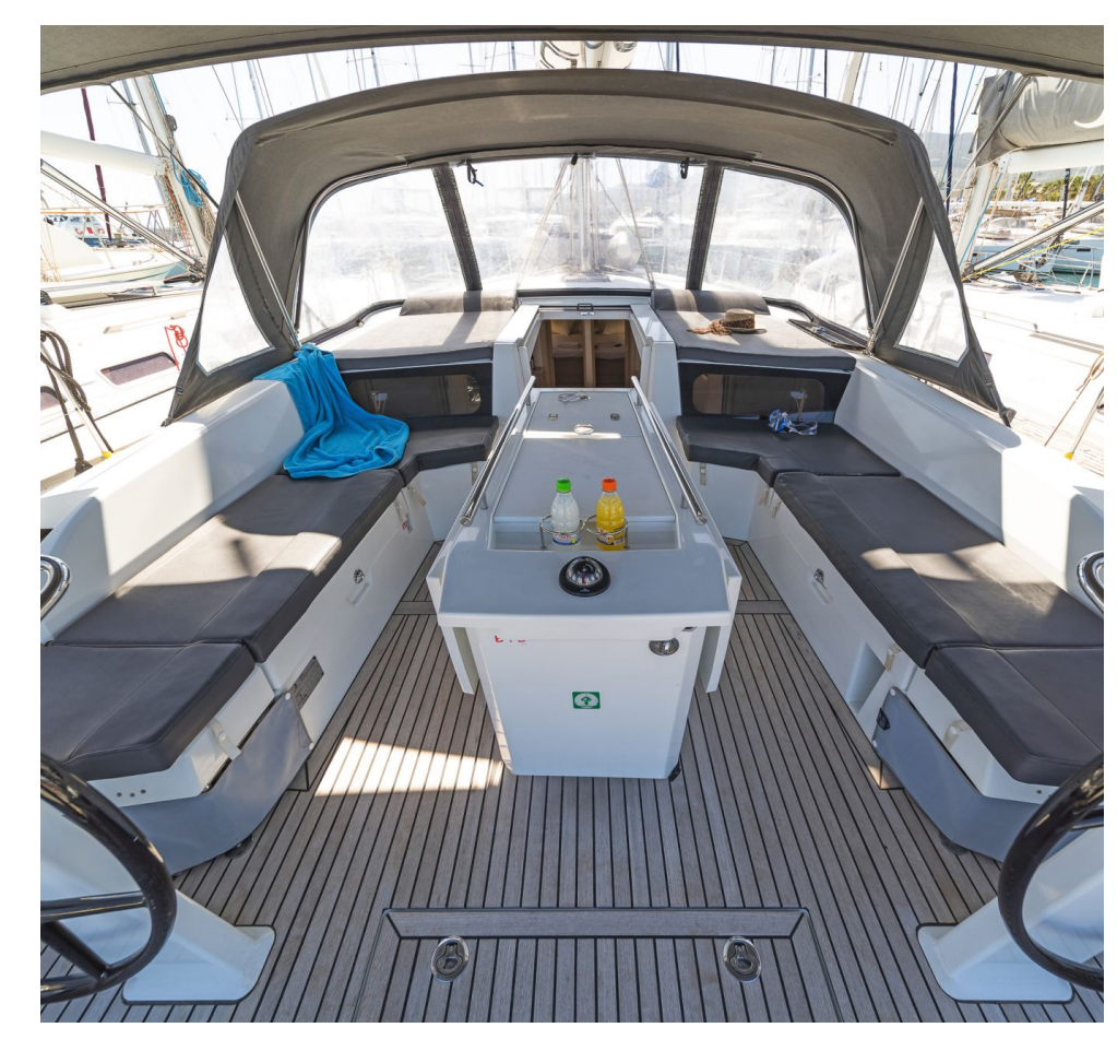
Oceanis 46.1 Beautiful Helen, Model 2020